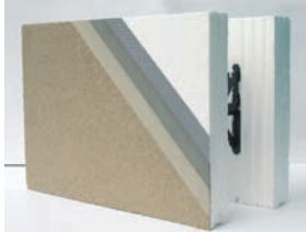
Finestone Textured Acrylic Surfacing Systems for ICFs